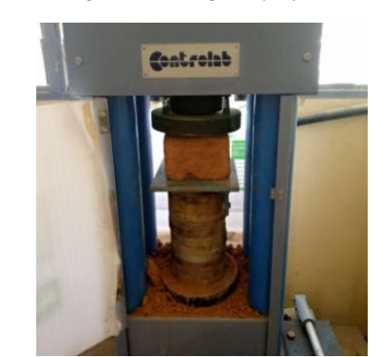
Figure 8: Crushing test of a compressed brick