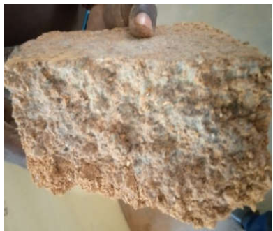
Figure 10: Section of a brick stabilized by the sound of rice

in Figure 10, this combination of two stabilizing techniques seems appropriate as we observe the absence of cracking and the geometric shape of the bricks are constant.